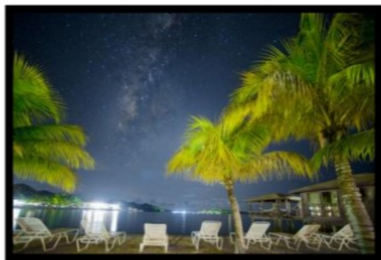
Experience Honduran Culture & Entertainment