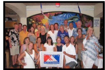
Enjoy a Beautiful Resort