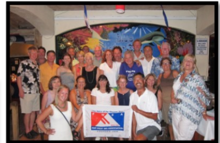
Enjoy a Beautiful Resort