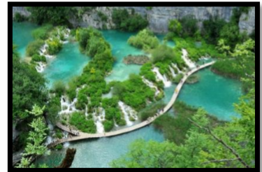
Visit historic locations