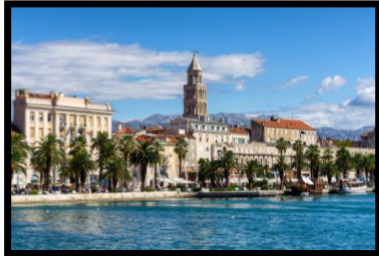
Gain unforgettable memories

TELL YOUR FRIENDS...HELP US FILL THE TRIP WITH 40 PEOPLE...YOU GET $250.00 BACK!