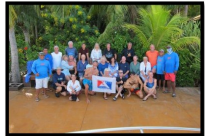
Enjoy a Beautiful Resort